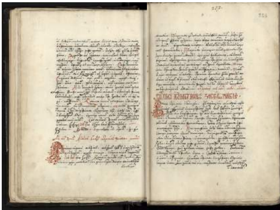
Fig. 5. Mircea the Old's charter for Cozia monastery, September 4 th , 1389 (cartulary – Slavonic copy) ( http://arhivamedievala.ro , BU-F-00642-712; accessible: January 2020)