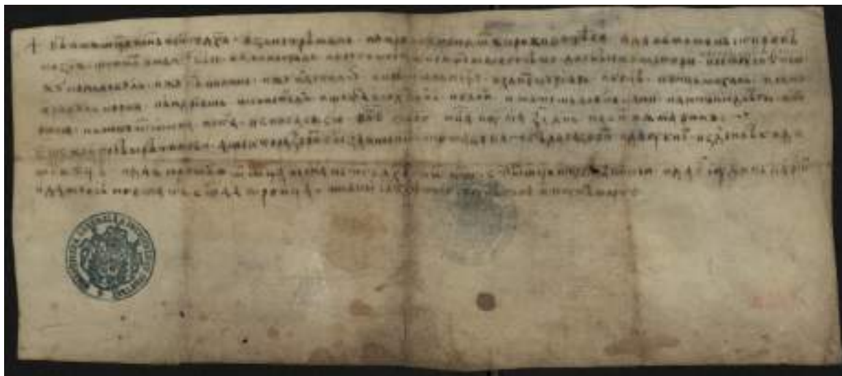
Fig. 1. Petriman’s donation for Cozia Monastery, July 17 th , 1425 (original) ( http://arhivamedievala.ro , BU-F-00684-26, accessible: January 2020)