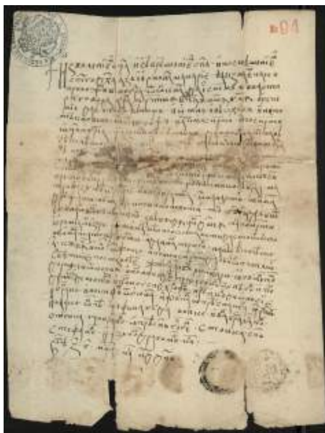
Fig. 3. Macarie's donation for Govora Monastery, March 24 th , 1495 (original) ( http://arhivamedievala.ro , BU-F-00684-94, accessible: January 2020)