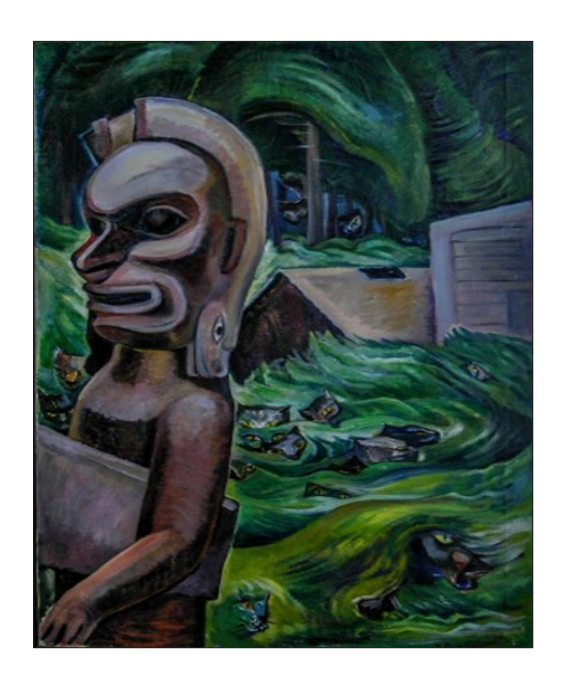
Figure 4. Emily Carr, Zunoqua of the Cat Village (1931) http://www.museevirtuel.ca/sgc-cms/expositions-exhibitions/emily_carr/en/popups /pop_large_en_VAG-42.3.21.html