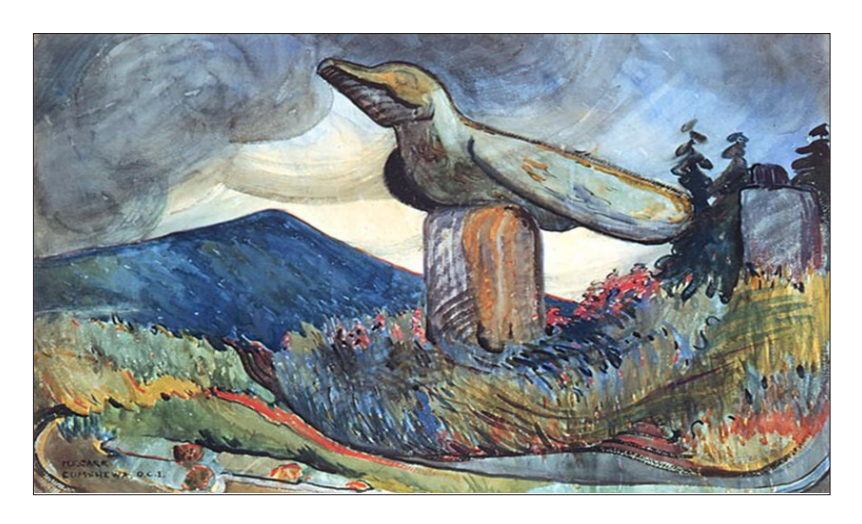
Figure 1. Emily Carr, Cumshewa (1912) http://www.museevirtuel.ca/sgc-cms/expositions-exhibitions/emily_carr/en/popups/pop_large_en.php?worksID=1378

tifies himself, nevertheless, as a Hungarian-Canadian, while Carr remains within her English-Canadian identity. Fujkin's paintings within the Blue Owl Project are a bricolage of images—relating to Native culture, symbolism, and the Mother Earth but the underlying messages move toward the hybrid potential as they draw very distinct parallels with native cultural beliefs and the beliefs of the Hungarian ethnic minorities beyond the borders of Hungary. Carr's paintings delve into native spiritualism but move toward a more pronounced depth in colour and nature imagery in her later works. The time gap between Carr and Fujkin, representing past and present, literally disappears through their highly individual interpretations of Native cultural symbolism and the imaginaries of nature. The two artists effectively project a universal (self-)portrait and do it by blending clearly distinct cultural identities.