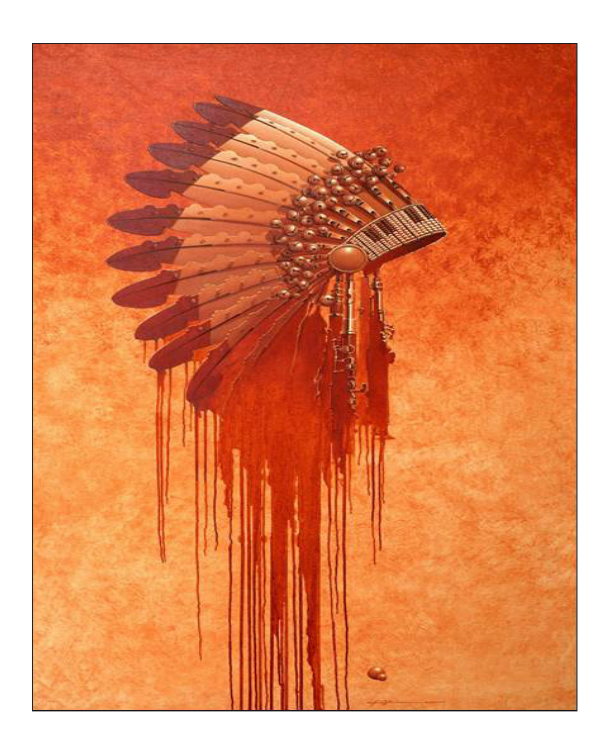
Figure 5. István Fujkin, It is a Good Day to Die (2004) Inspired by the song "It is a Good day to Die" by Robbie Robertson Oil on canvas 160 cm x 100 cm (by permission of the artist)