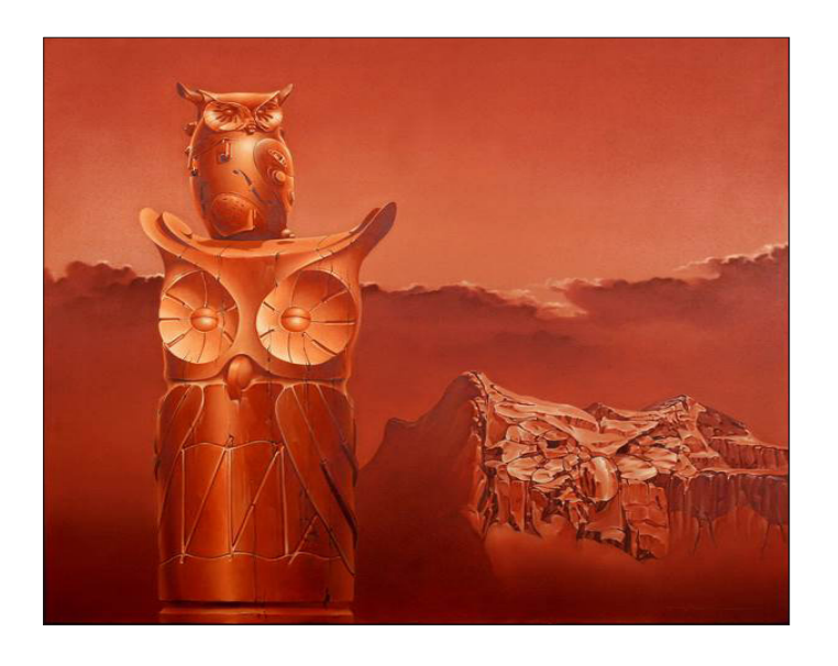
Figure 6. István Fujkin, The (Not) Vanishing Breed (2001) Inspired by the song "The Vanishing Breed" by Robbie Robertson Oil on canvas 130 c x 130 cm (by permission of the artist)