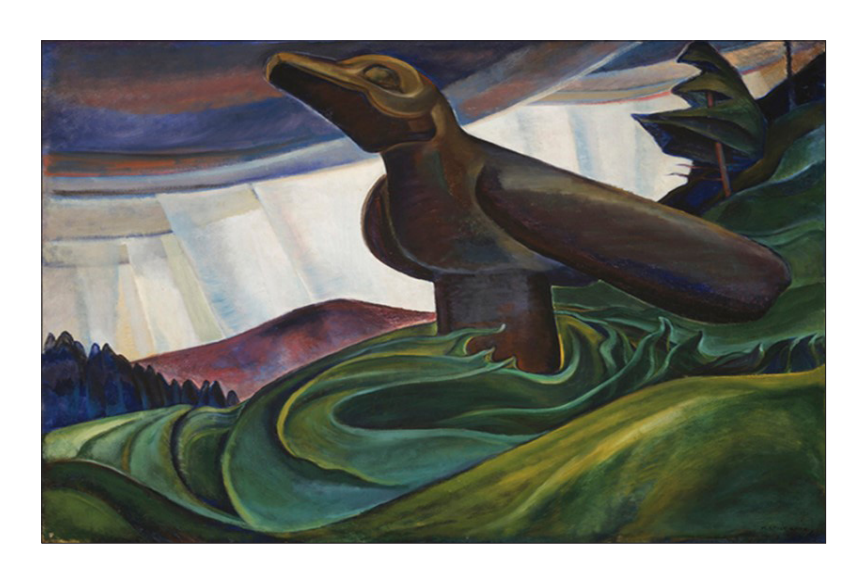
Figure 2. Emily Carr, Big Raven (1931) http://www.museevirtuel.ca/sgc-cms/expositions-exhibitions/emily_carr/en/popups/pop_large_en_VAG-42.3.11.html