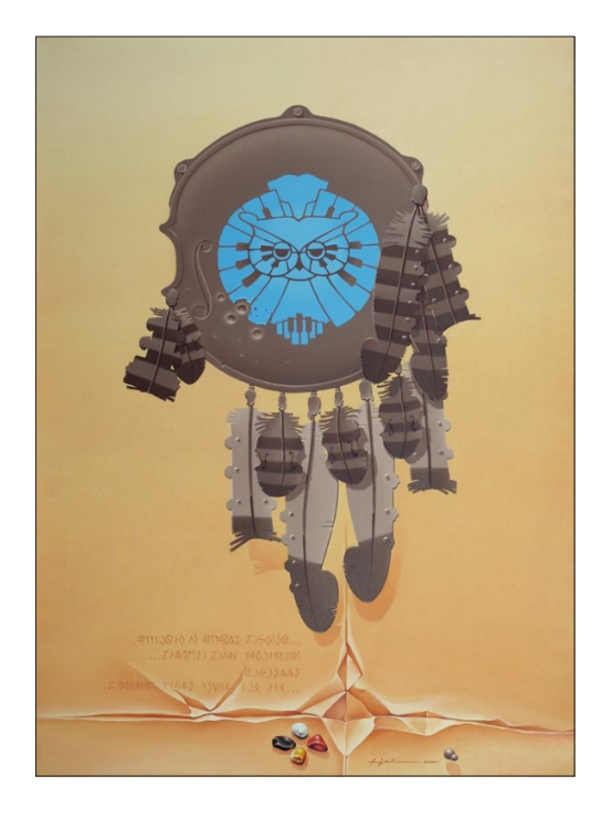
Figure 7. István Fujkin, Psalm (2005) Inspired by the songs "Pray" and "Peyote Healing" by Robbie Robertson Oil on Canvas 130 cm x 90 cm (by permission of the artist)