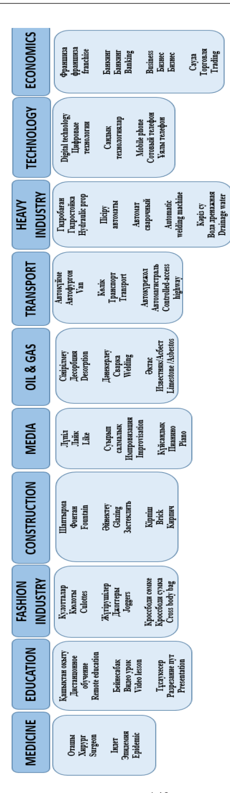
Picture 1. Terms featuring the linguistic interference in various domains